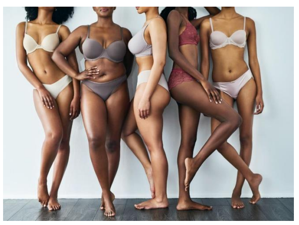
Note: Picture Use from Google Search for reference only