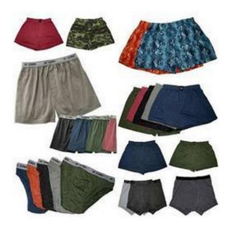
Note: Picture Use from Google Search for reference only